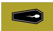
The Men Who Become Dads After Death