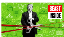
Trump’s Budget Hypocritically Slashes 3 Big Areas in Science