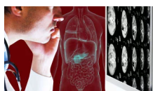
Why Is Pancreatic Cancer Such a Dreaded Diagnosis?